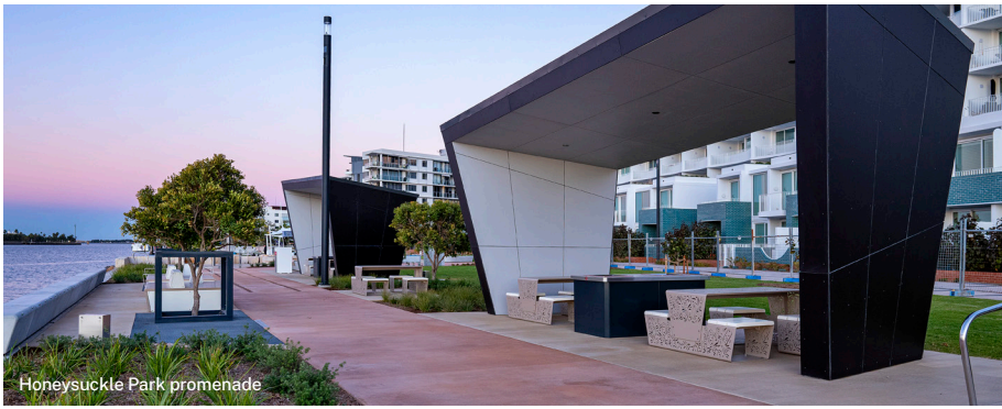
Honeysuckle Park promenade